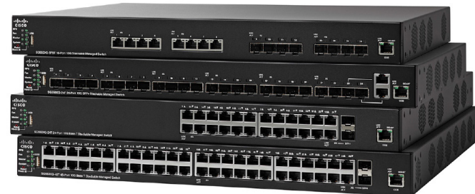
Figure 1. Cisco 550X Series Switches

Cisco 550X Series Stackable Managed Switches (Figure 1) offer the flexibility you need to meet your business requirements. These switches offer 24- to 48-port Gigabit or Fast Ethernet with 10 Gigabit uplinks, and 16- to 48-port 10 Gigabit Ethernet with both copper (10GBase-T) and fiber (Small Form Factor Pluggable Plus [SFP+]) options.