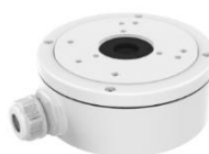
CBS Junction Box